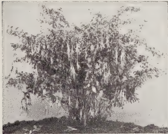
Hardy Fuchsia "Senorita"